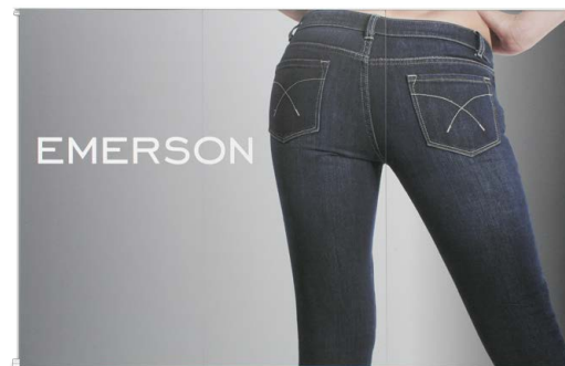
Graphic Track with 3 graphic panels

10. When the graphic panel sits in the bottom channel, The top 5mm of the graphic will be held by the top track.